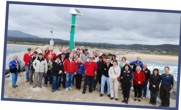
The Sydney group by river and the sea on the South Coast