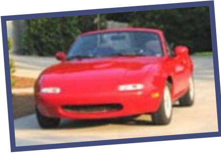
The Mercurial Mazda MX-5 NA

The sweet lines of the successor – the NB