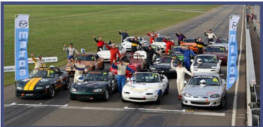
Goodbye Folks - it's all over for another five years!