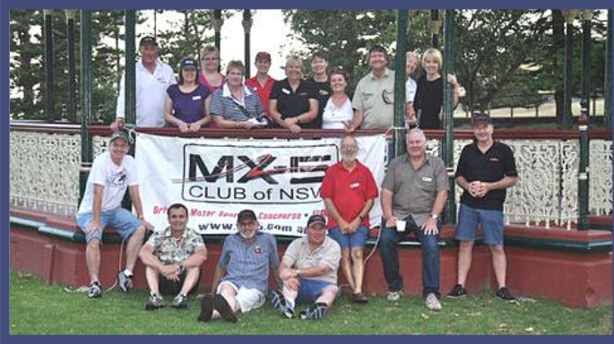
Time out on a Hunter Chapter run!