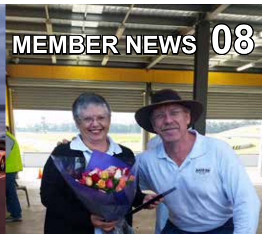
MEMBER NEWS 08