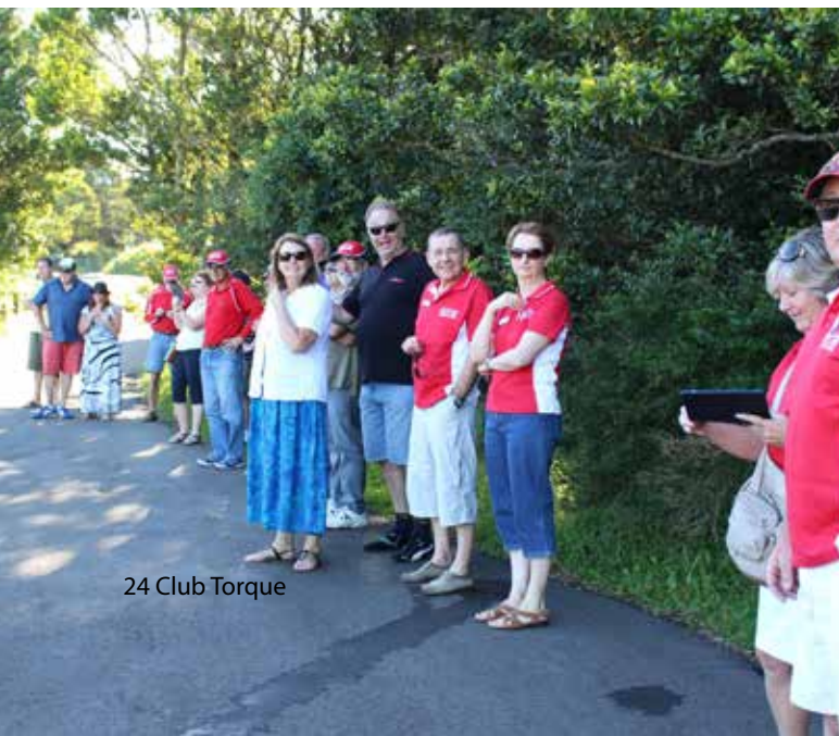
24 Club Torque

spectacular on a variety of levels. The members exuded warmth and friendship, the procession of beautiful cars was both fun and gave you this enormous sense of pride, and the drive allowed us to see and experience parts of the Illawarra that would be unobtainable from our everyday car. It was not what we expected ... but we wouldn't have missed it for the world.