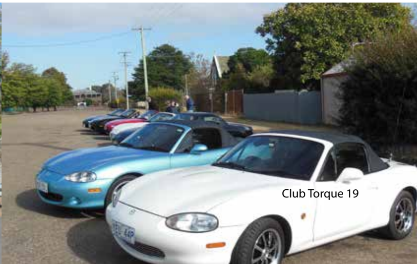
Club Torque 19