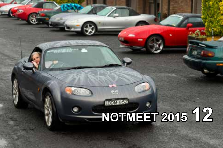
NOTMEET 2015 12