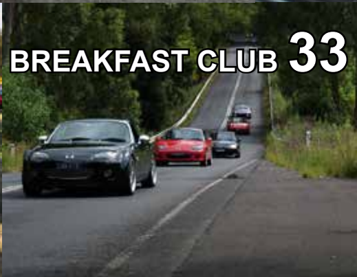
BREAKFAST CLUB 33