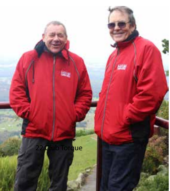
22 Club Torque

We awoke to a blustery, damp Sunday morning on the 26th of April for the Illawarra Chapter's 'Magical History Tour', which didn't bode well for a good turn out. Contrary to expectation, however, a bumper turnout of undeterred wet-weather-warriors descended upon Haywards Bay Hungry Jacks for a very civilised 10am start. I was especially thankful for this, as it meant that I was awake enough to take the wheel for the whole trip, rather than having to share with my father and settle for the ride home!