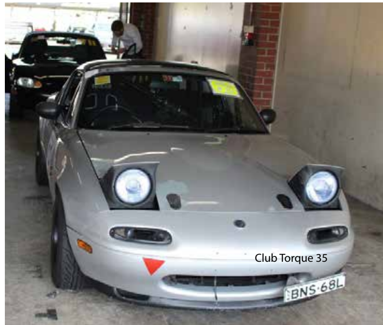
Club Torque 35