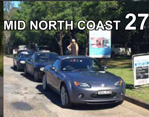
MID NORTH COAST 27