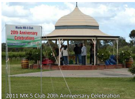
2011 MX-5 Club 20th Anniversary Celebration

The club has been more active than ever with mid-week runs that have been very well supported, and are more adhoc than formal organised events. They give our members with common interests the chance to meet, drive and eat.