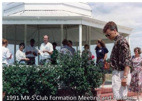
1991 MX-5 Club Formation Meeting and Auction

Another great day was held at the McCaul's farm, we cooked a lamb on a spit, spuds on the fire and sat around a camp fire celebrating 20 years of the Club.