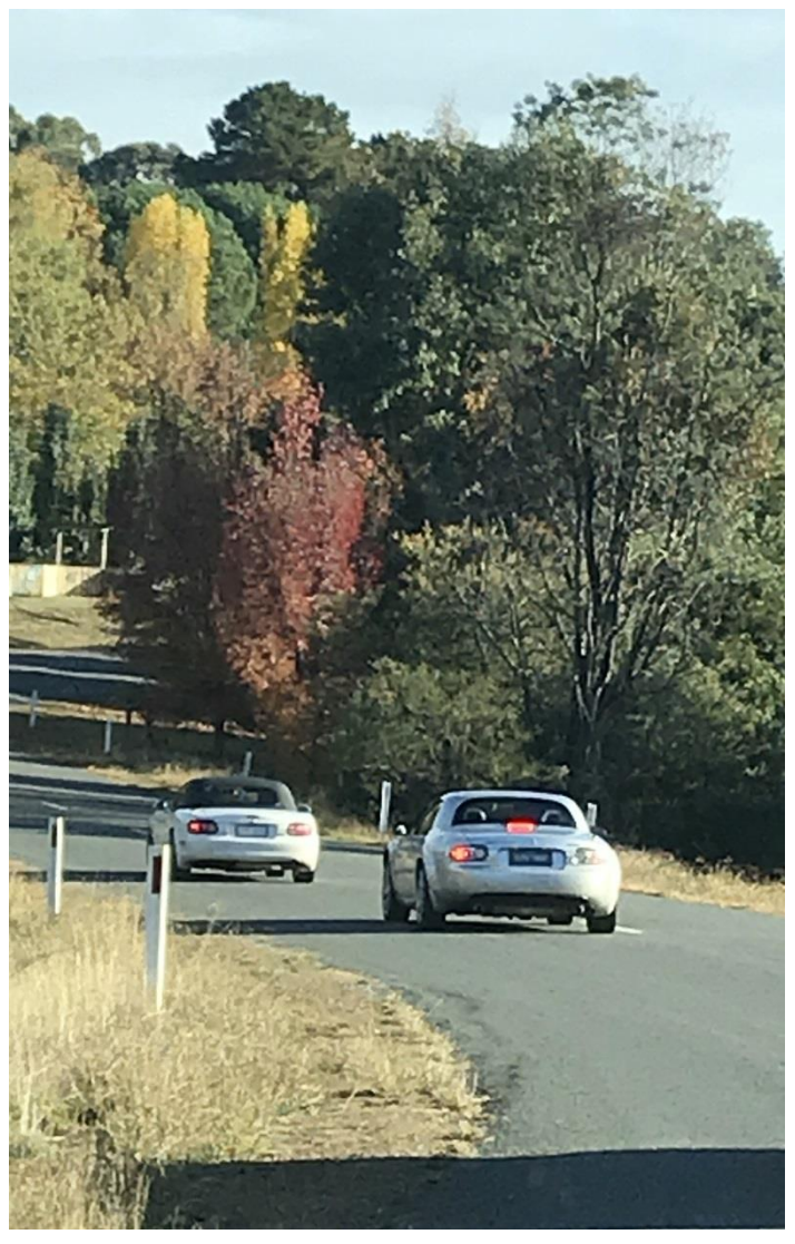
On the by-roads (SO)

With bodies refuelled, the afternoon's route was again via the rural roads less-travelled ( parts very much so ) from Tumut to Brungle and on to cross the Murrumbidgee at Gobarralong and then on to Coolac to re-join the Hume Freeway and on to our afternoon break at Jugiong.