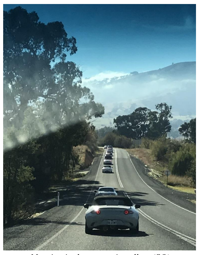
Morning in the mountain valleys (SO)

At the Tawonga Gap we took the opportunity for a group photo before dropping down into the Kiewa Valley to run up the eastern side of the valley and across to the Hume Weir.