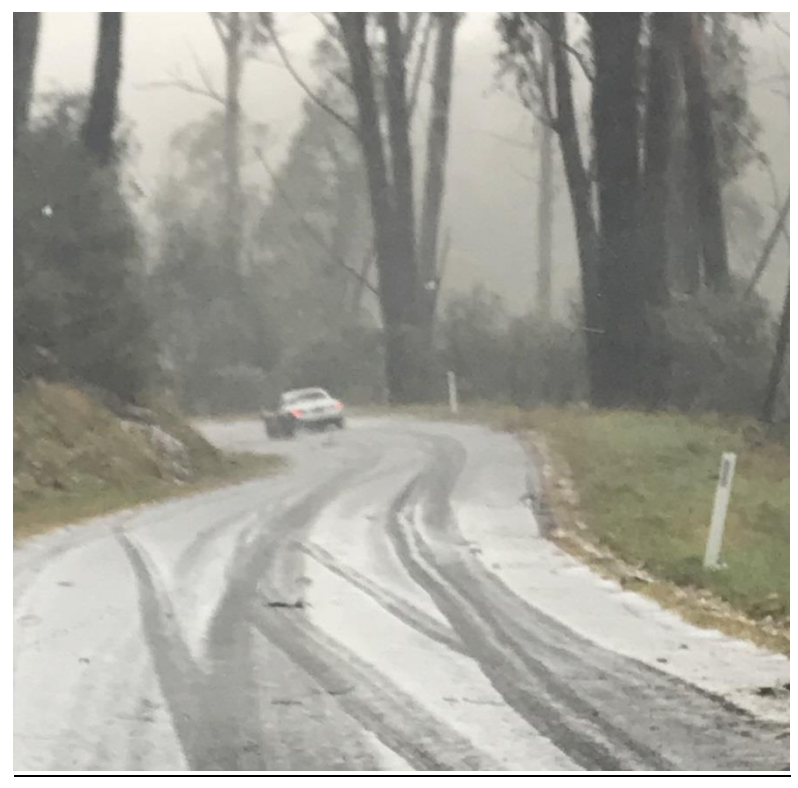
Who braked too hard?? (SO)

This unexpected hazard provided some interesting moments for those not experienced in cold country driving - DO NOT STAMP ON THE BRAKES!!! Much better to use the gears... No one came to grief, despite obvious evidence of an exciting moment for someone!