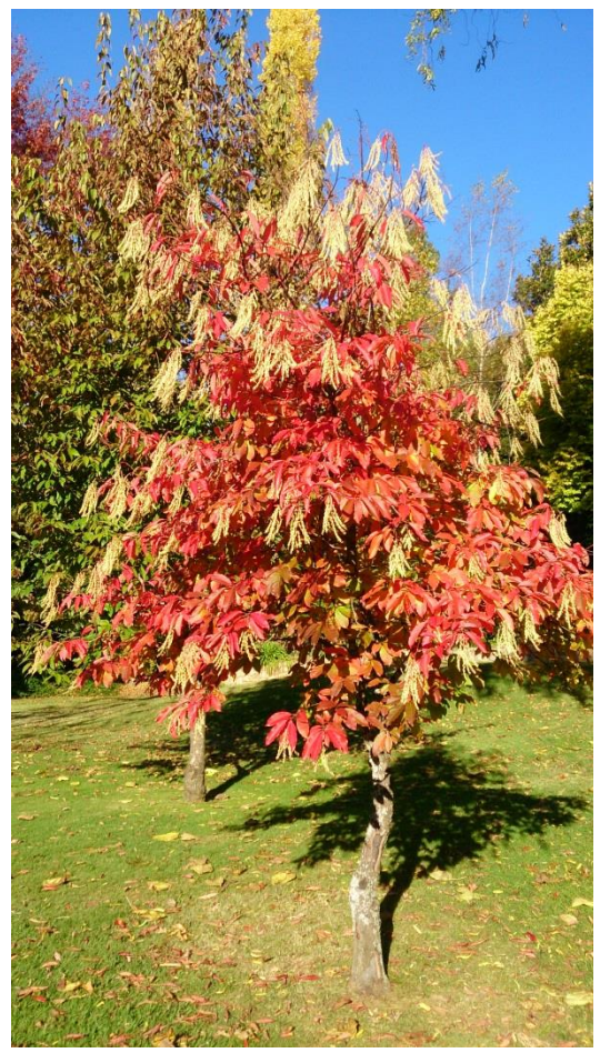
An unusual tree in an Open Garden (KK)

Our motel location in central Bright meant an abundance of choices for dining within easy walking distance and our evening was ad hoc dining at The Star Hotel which provided a good venue for our informal group gathering.