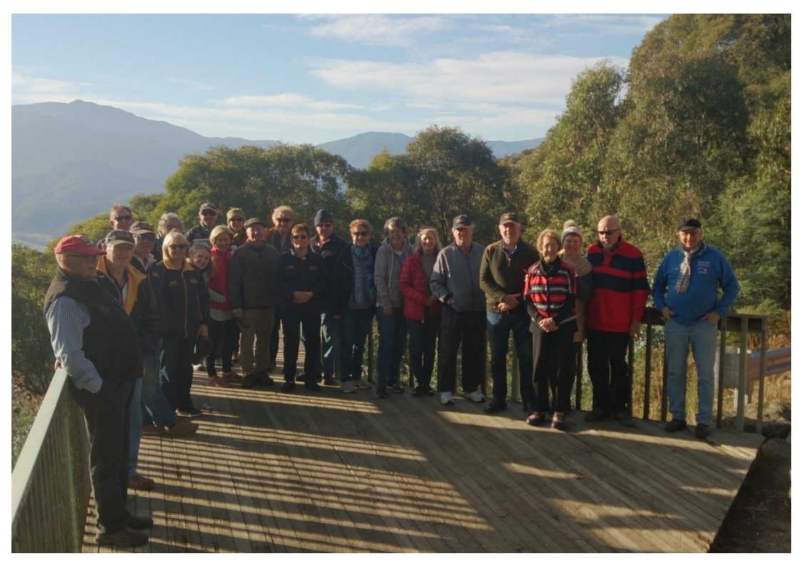
Morning light at the Tawonga Gap (KK)

At the Tawonga Gap we took the opportunity for a group photo before dropping down into the Kiewa Valley to run up the eastern side of the valley and across to the Hume Weir.