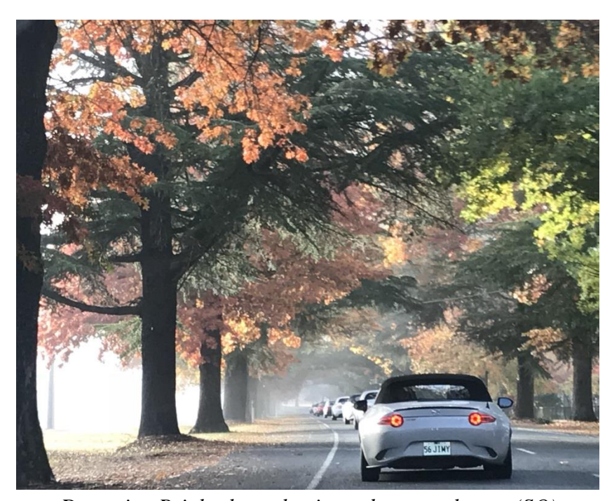
Departing Bright through mist and autumn leaves

Sunday dawned cool and misty for our home run, with several cars electing to take the more direct Hume Highway route. After the ritual briefing, the residual 12 cars departed Bright for a chilly drive over the Tawonga Gap to the Kiewa Valley and, via the byways, homewards.