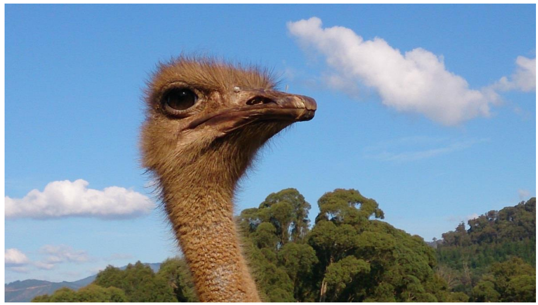
Some of the locals kept a wary eye on the visitors (KK) Back in Bright, it was an evening of individual choice, some grazing and others trying new restaurants but, with a reasonable early start in the morning, most were not too late to bed.

After lunch, the group broke up for the return to Bright, some studying the locals at the Red Stag (and also being studied!) with others exploring new roads and wineries on the way back.