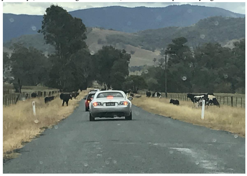
Another kind of rural road hazard (SO)

With the snowy section safely behind us and the rain showers abating, the run down to join the Murray Valley Highway near Khancoban was an enjoyable excursion through high country scenery (and wandering rural hazards) to our lunch stop at Corryong.