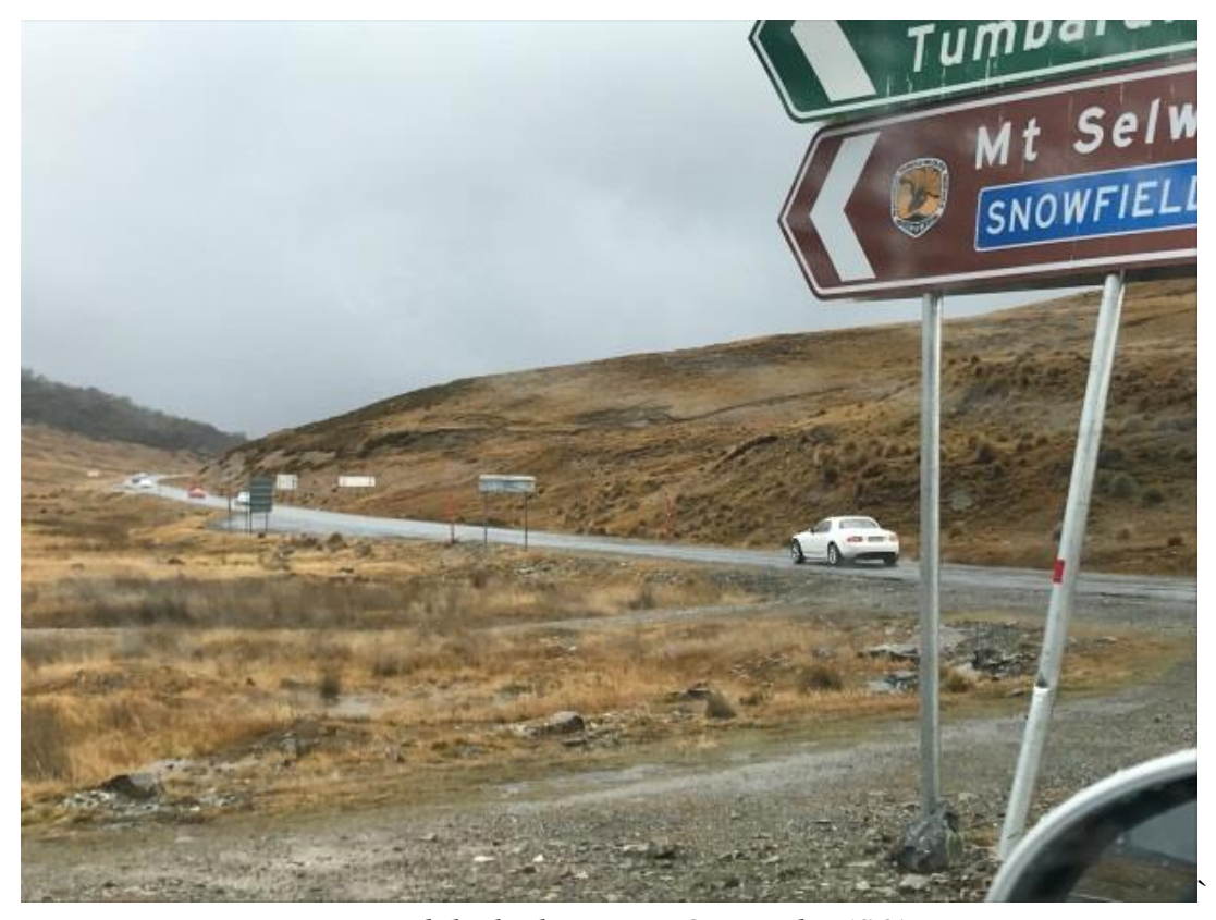
Toward the high country

A dreary, drizzly morning greeted us as we headed toward the rendezvous, which did not bode well for the run through the Snowy Mountains on the way to Bright. Fortunately, the weather gods smiled and the briefing was carried out between gentle showers we were able to depart on time. The intermittent rain became less frequent as our 12 cars in two groups ran south on the Monaro Highway, picking up two more cars before the first pause to regroup at Cooma, then heading on the Snowy Mountains Highway via Adaminaby to Kiandra.