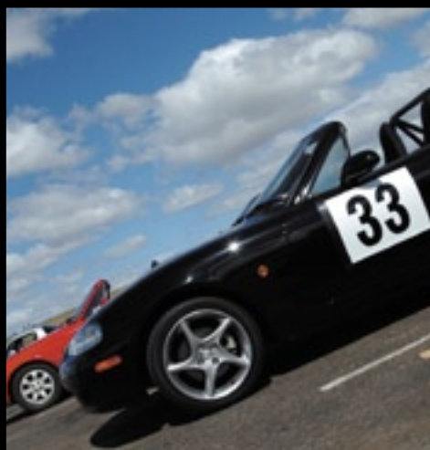
SuperSprint Who won the day and who embarrassed themselves