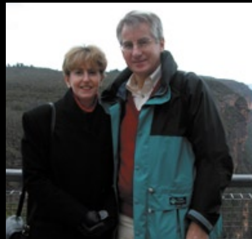
Meet the Committee Who are the committee? What do they drive?