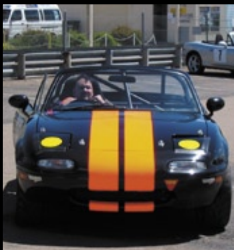
Whoah Black Beauty